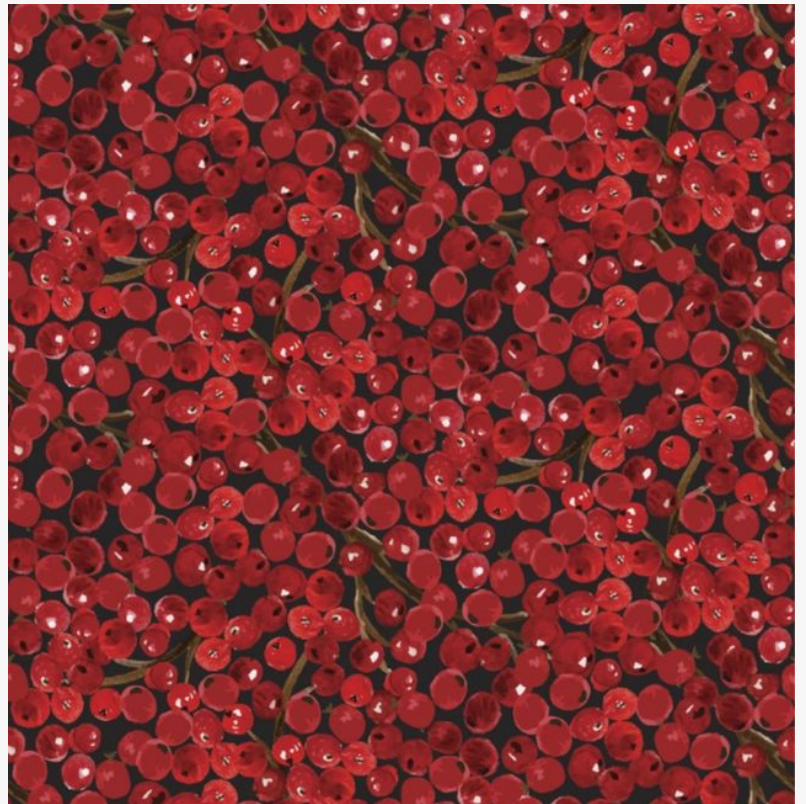
Floral Pattern Fabric Collection