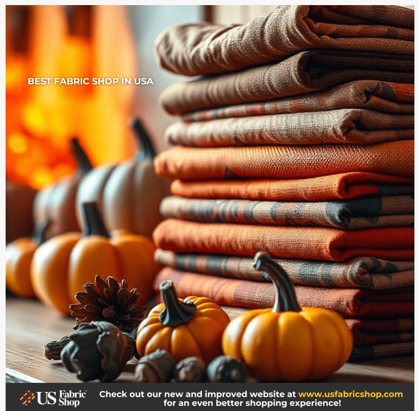
Best Fabric Shop US