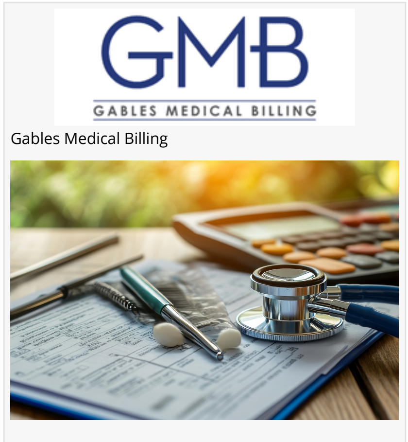
Gables Medical Billing

EINPresswire.com/ -- Gables Medical Billing (Gables Medical Billing), a leading medical billing company with over 20 years of experience, is helping pediatric practices across Florida optimize their revenue cycle and reduce administrative burdens. Gables Medical Billing offers specialized pediatric billing and coding services designed to address the unique needs of pediatricians, allowing them to focus on providing quality care to young patients.