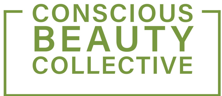
Conscious Beauty Collective logo

EINPresswire.com/ -- The Conscious Beauty Collective continues to gain ground with the innovative “pop-in” concept by partnering with small like-minded businesses across the United States. The Conscious Beauty Collective is a group of 50+ indie beauty & wellness brands run by MASAMI haircare. The pop-ins are curated shelves of 10-15 brands that are curated to fit within a retailer’s space, hand selected to cater to their customers. The Conscious Beauty Collective selects retail partners who share their values – also small business owners who believe in high performing, clean beauty products, they are sustainably minded and they give back to the community.