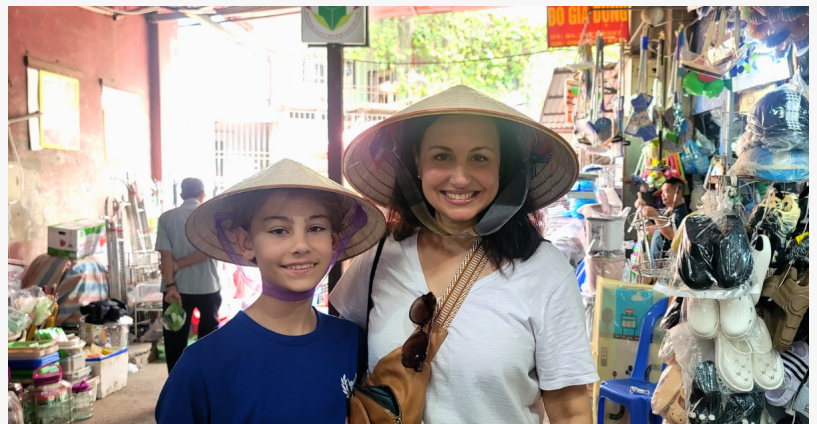
Mother and son explore local places during their vacation in Vietnam