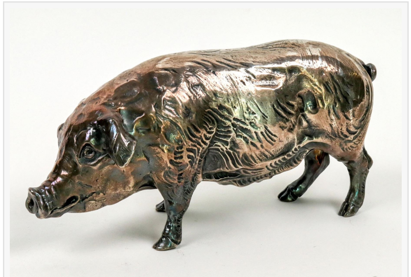
Artist Brad Rude was commissioned in 2013 by John Ascuaga's Nugget Casino and Resort to create this solid silver pig, which weighs 102 troy silver oz. and should sell for $10,000-$15,000.

One lot in particular expected to draw keen bidder interest will come on Day 4. It's lot #4001, the Carson City (Nev.) Branch Mint Troemmer special bullion balance scale used from 1870-1893. The 31-inch-tall balance was built into a waist-high table for ease of use at the Mint. The set, with two framed signs, was on display at the Nugget Casino in Nevada for about 70 years. It's the most important numismatic artifact to surface in many decades (est. $25,000-$50,000).