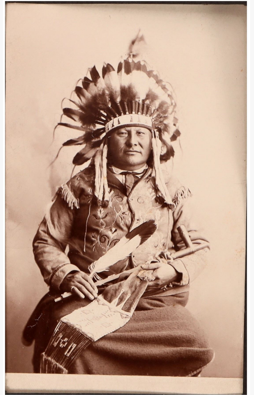
Cabinet card signed in pencil by Sioux Chief Rain-In-The-Face, the man who personally killed Gen. George A. Custer, taken for the Chicago World's Fair of 1893 (est. $10,000-$20,000).

The general store, advertising, furniture and antiques categories span many sessions. Featured is a collection of wonderful general store advertising goods, and another of about 50 pieces of circa 1910-1940 oak furniture in fine condition, priced very reasonably. Also included are antique glass hanging lamps. There will be a special on-site preview day for this section, by appointment.