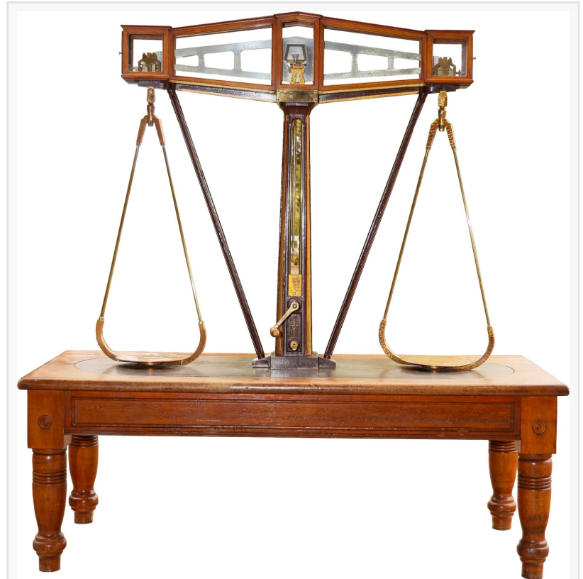
The Carson City (Nev.) Branch Mint Troemmer special bullion balance scale used from 1870-1893, is the most important numismatic artifact to surface in decades (est. $25,000-$50,000).

That can be accomplished by logging on to https://online.pubhtml5.com/esfe/ntoe/#p=1 . Online