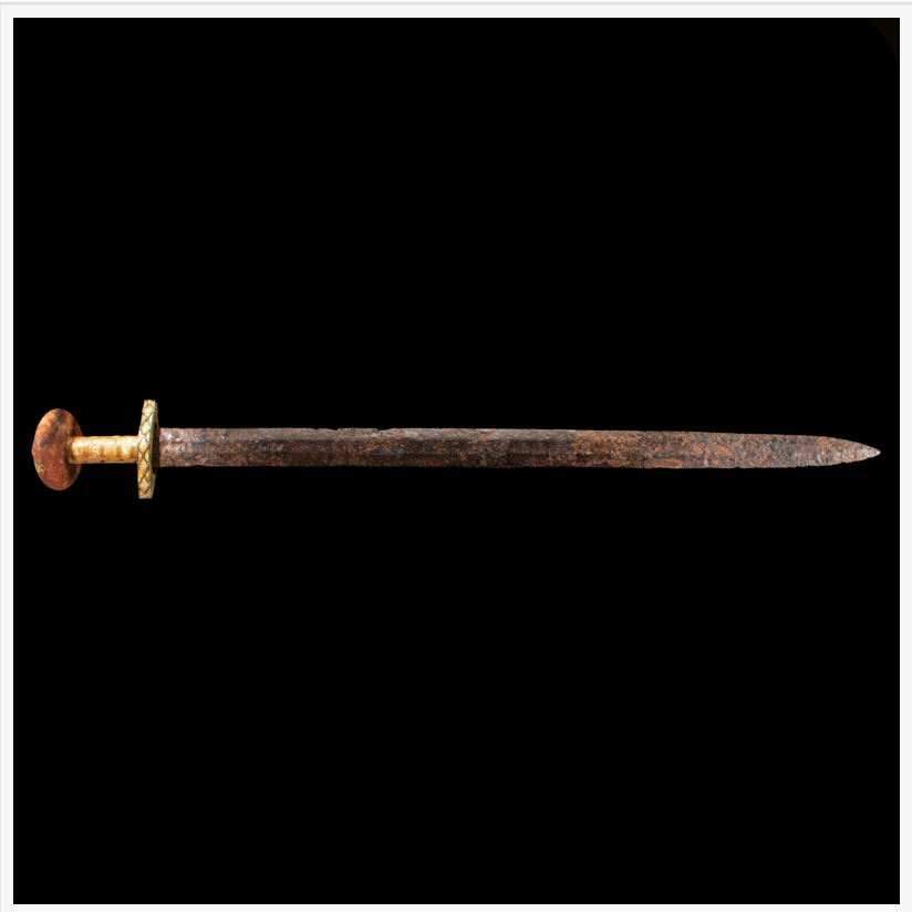
Merovingian longsword, circa 400-600 AD. Bronze crossguard and wood handle highly decorated with gold leaf. Large stone pommel secured by gold- and glass-adorned end cap. Opening bid: £12,000 ($15,562)

Ancient Mediterranean art is led by a circa 100 BC to 100 AD Greek pale yellow cut-glass skyphos with tapering vertical walls and integral ring handles formed between plates. After casting, this handsome, well-balanced vessel