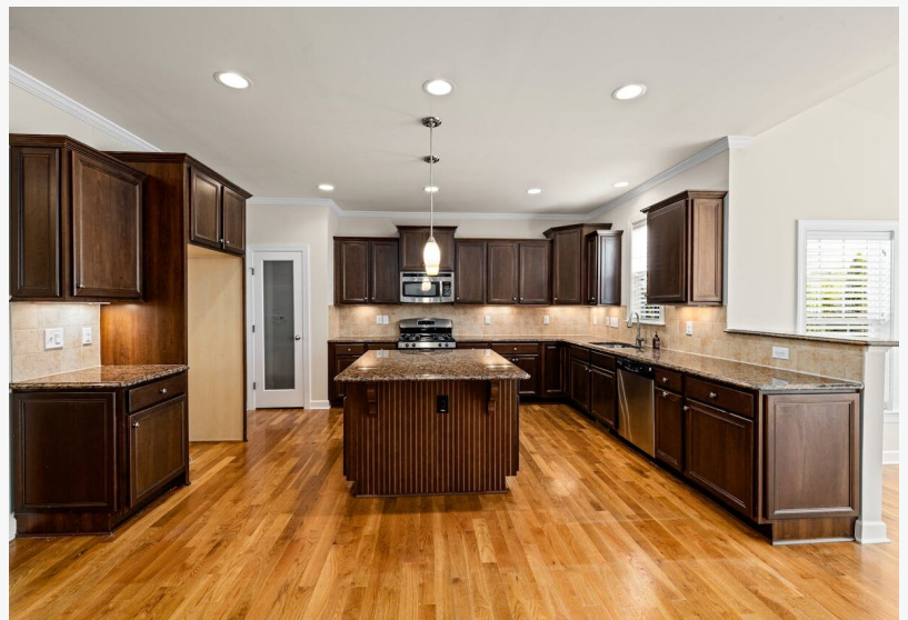
Cabinet Painting St Louis