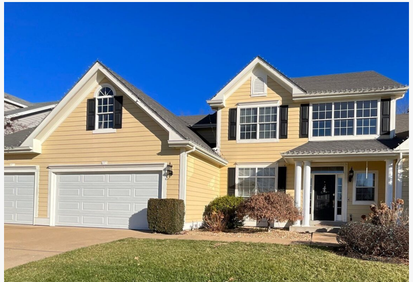
Exterior Painting St Louis