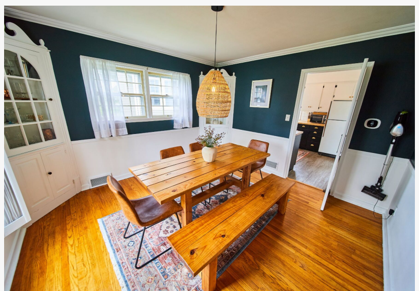
Interior Painting St Louis

"Our vision extends beyond mere painting services," Baker explained. "We're committed to redefining