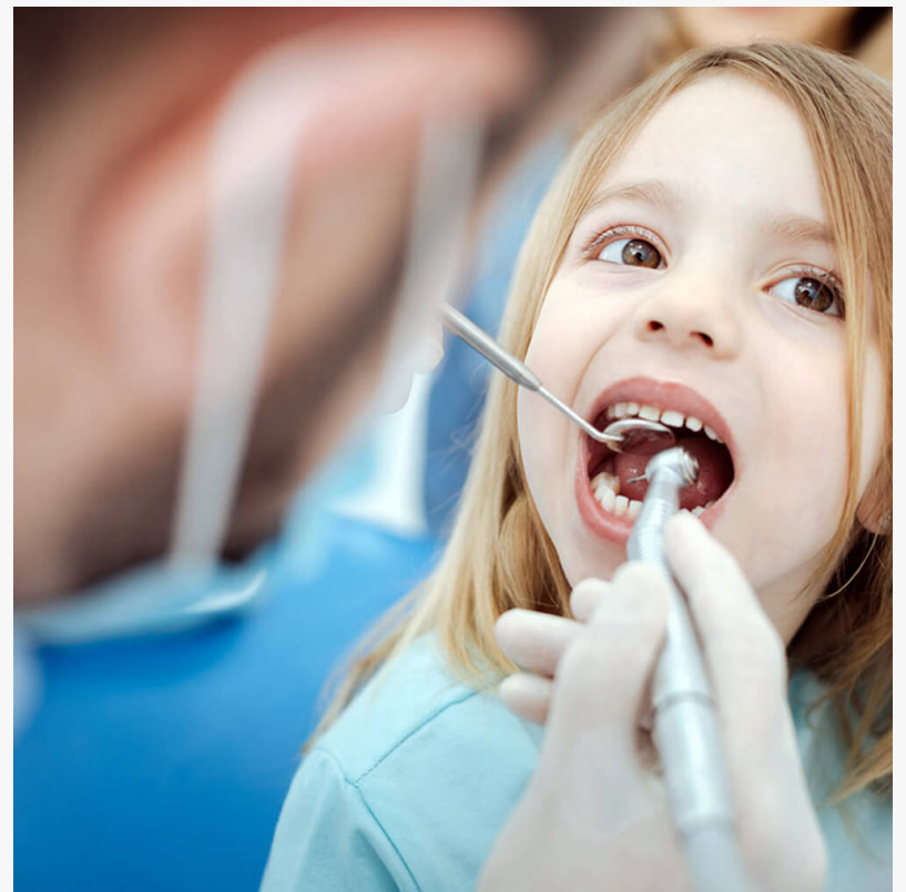
best Children ENT specialist