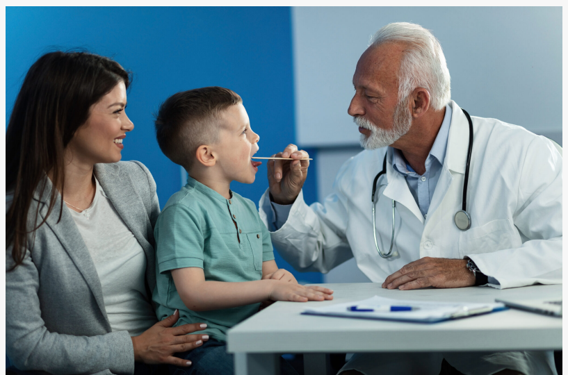
best Children ENT Specialist