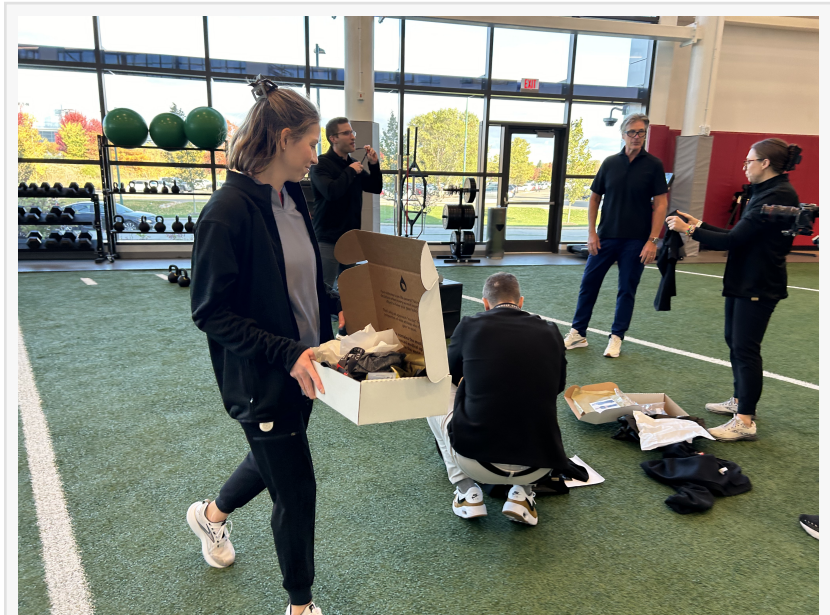
UH Dursinsky Sports Medicine Institute staff gather to pick up their new, technical medical scrubs from Kyur.

medical team. Kyur’s healthcare line provides comfortable, fashionable clothing that makes them