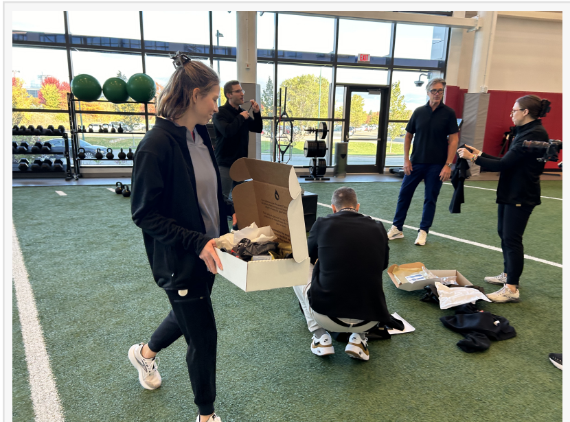
UH Drusinsky Sports Medicine Institute staff gather to pick up their new, technical medical scrubs from Kyur.

medical team. Kyur’s healthcare line provides comfortable, fashionable clothing that makes them