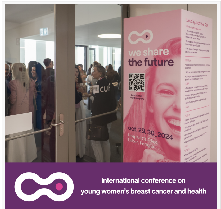
BCYWF and CUF Conference on BCYW: In-between Scientific Sessions

The international event also covered the biology of breast cancer in young women, updates on treatment, clinical trials, and the unique challenges these patients face, including fertility, career, and emotional well-being. The BCYW Foundation and experts highlighted the urgent need for targeted research and improved care to tackle the increasing number of cases among young women.