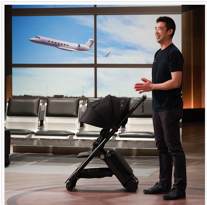
As Seen On Shark Tank

Beyond its functionality, the stroller-luggage hybrid speaks to a broader shift in travel products to make family journeys more manageable and enjoyable. TernX taps into a growing market of travel solutions that prioritize efficiency without compromising on quality or safety. The company sees this product as the first in a series of innovations designed to support families in their travels. TernX emphasizes that this product is not just a convenience but a reflection of the joy of shared travel experiences, aiming to enhance family journeys by making them smoother and less stressful.