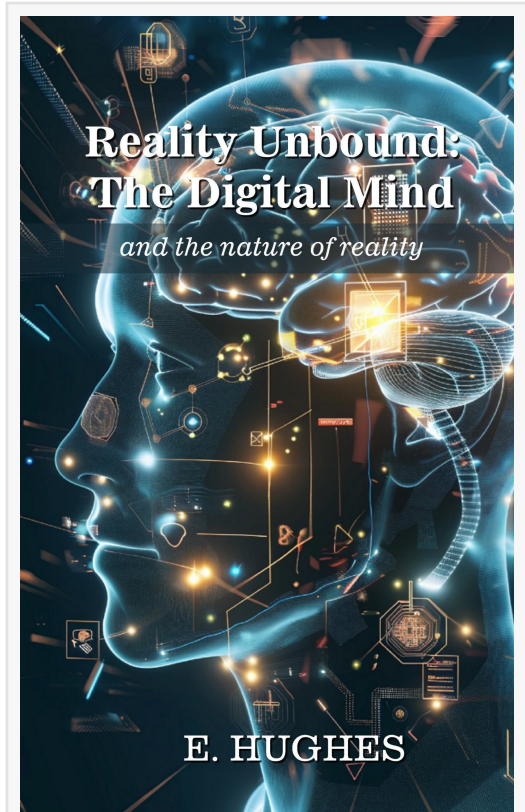
Reality Unbound: The Digital Mind (and the nature of reality) by E. Hughes

Reality Unbound urges readers to rethink the distinctions between humans and machines, challenging traditional views on life, intelligence, and consciousness. With thought-provoking arguments and an inquisitive tone, Hughes opens a new perspective on what it means to be "alive" in a world increasingly influenced by digital interfaces and artificial intelligence. Reality