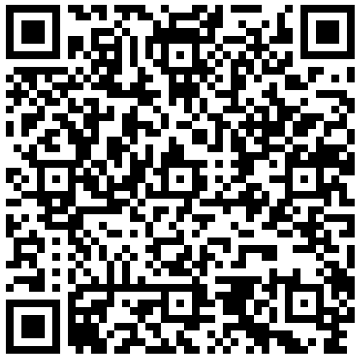
Enlistment into the Union Army Shareable Link