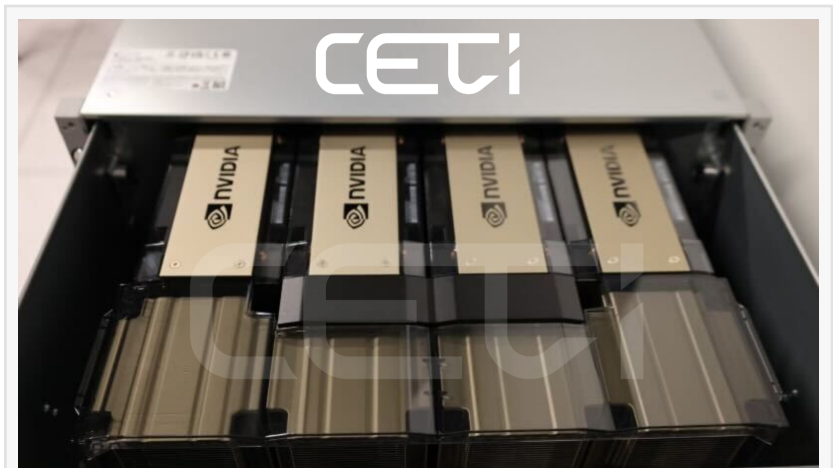
CETI h100 Hardware