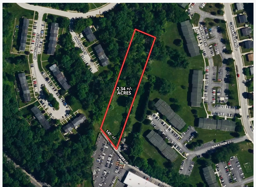
2320 Powers Ln., Catonsville, MD 21228