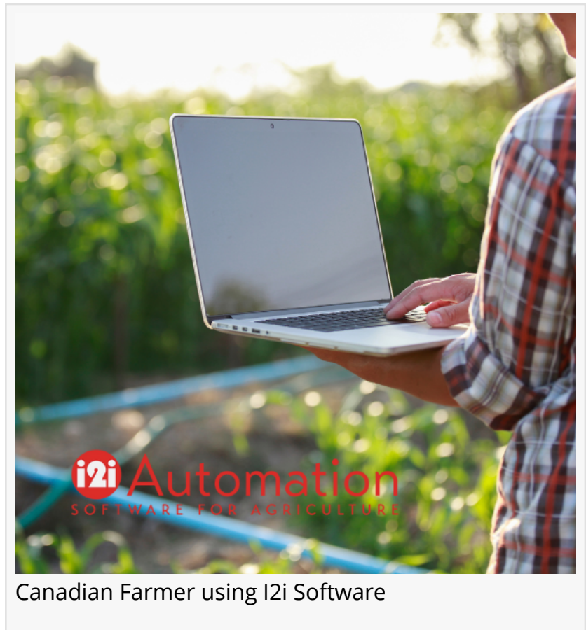
Canadian Farmer using I2i Software