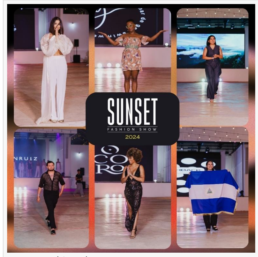
Sunset Fashion Show

Once again, Grupo Sunset World created the perfect atmosphere for an extraordinary fashion show, where the