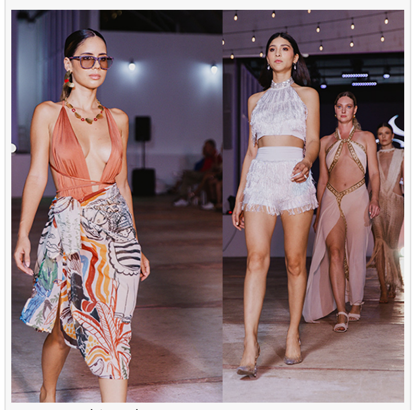
Sunset Fashion Show

energy produced at Mexican wind farms and geothermal plants, which has considerably reduced the company's carbon footprint. The activity and gastronomy programs in all six hotels are