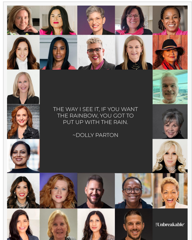
I am unbreakable image two