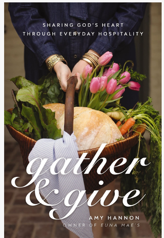
Gather and Give Book Cover