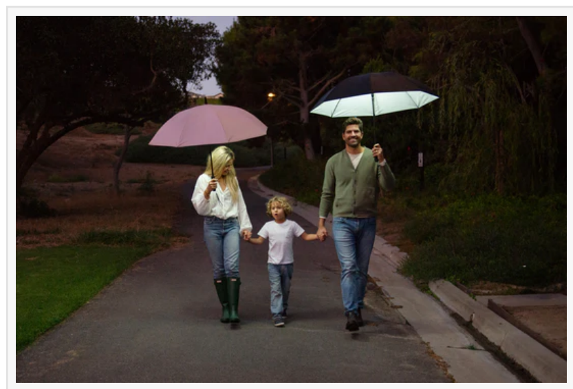
The Droplit umbrella increases visibility and safety

Droplit Umbrella is a new direct-to-consumer product, designed to be popular with a broad audience. Not available in stores, this thoughtful and useful item and great gift idea is only available on the company's website at: droplitco.com. By offering the umbrella directly to consumers, the company is able to keep costs down and offer special deals - including free shipping options and other discounts.