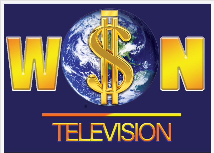
THE WINNER TAKES IT ALL