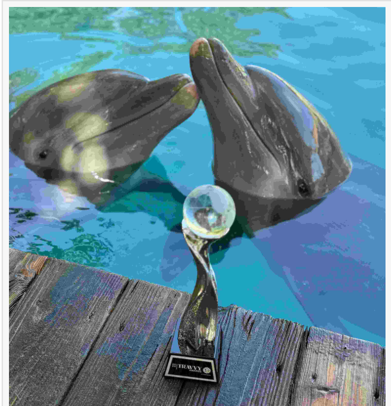
The Dolphin Company Travvy Awards

The 10th edition of the Travvy Awards took place on November 7 at the Fort Lauderdale