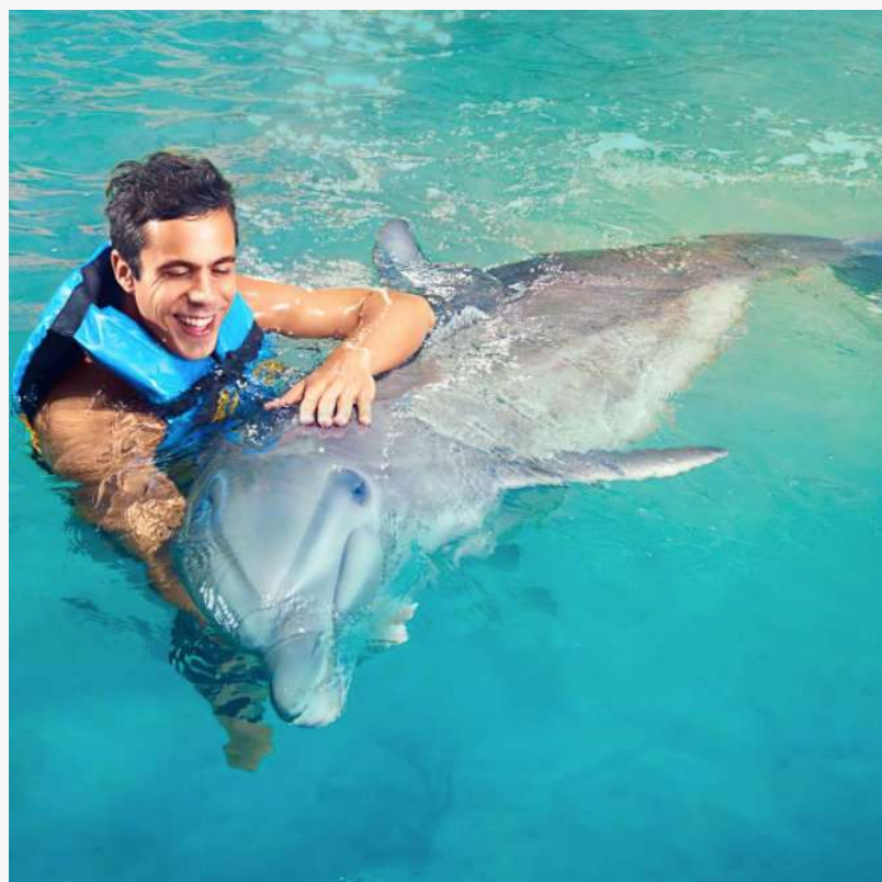
Dolphin Swimming Program

This press release can be viewed online at: https://www.einpresswire.com/article/760278115