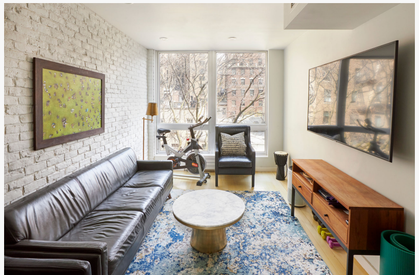
Ascendant Detox - NYC Inpatient Marijuana Rehab