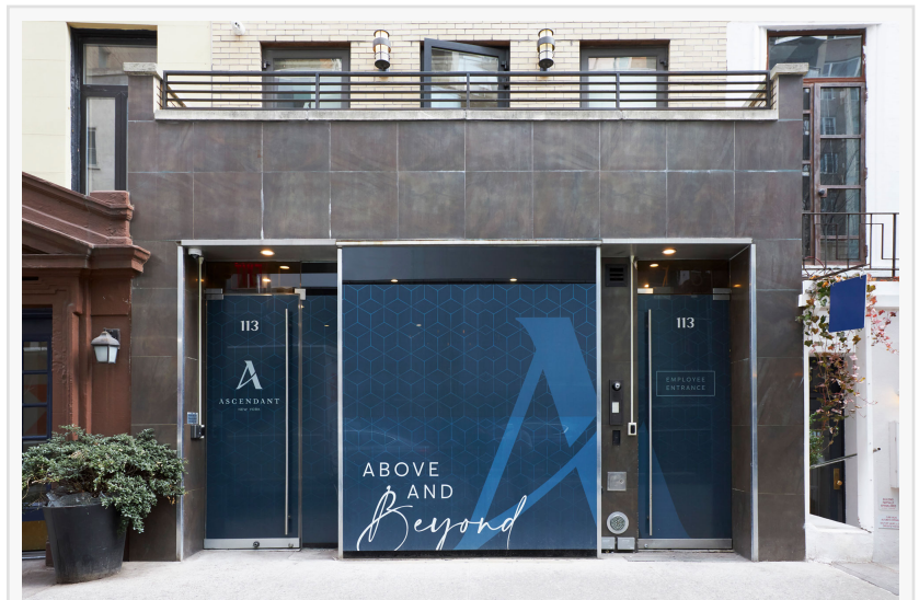
Ascendant Detox - NYC Outside View

Ascendant Detox - NYC believes in making recovery accessible for everyone, with dedicated