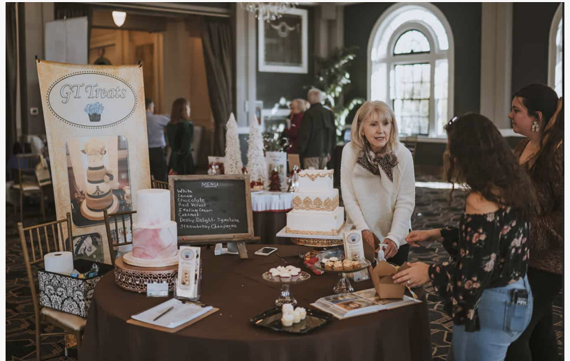
Treats and cakes display at the Ultimate Wedding Expo, Louisville.

EINPresswire.com/ -- Louisville's Ultimate Wedding Expo has shattered attendance records this year as couples return in droves to rediscover the unparalleled value of in-person wedding shows. Ticket sales surged by an unprecedented 300%, transforming this year's expos into vibrant hubs where couples and wedding professionals connect in meaningful ways and rekindle the magic of hands-on wedding planning.