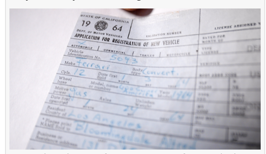
Original application for registration of new vehicle, dated 1964, signed by Alfred Bloomingdale

scholarship recipients are students of color with a household income of less than $43,000 and are five times more likely to finish college than their peers.