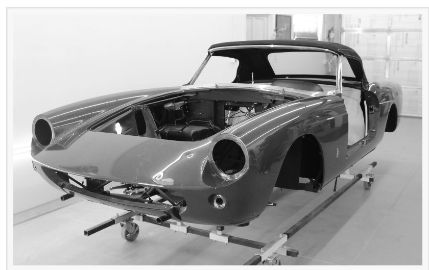
Rare 1964 Ferrari 400 Superamerica Pininfarina Cabriolet

OAKLAND, CA, UNITED STATES, November 13, 2024 / EINPresswire.com/ -- In a remarkable fusion of luxury and philanthropy, The BASIC Fund, a nonprofit that funds school scholarships for low-income students and families, is completing the restoration of an extremely rare 1964 Ferrari 400 Superamerica Pininfarina Cabriolet (s/n 5093). It will be presented for public viewing and sale in 2025.