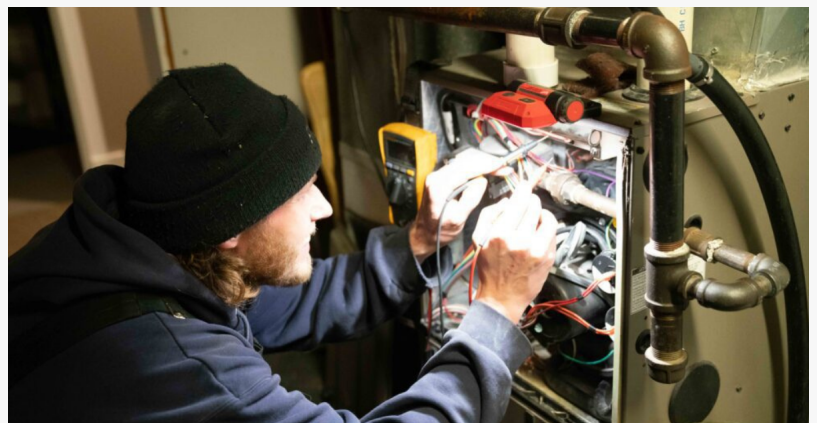
Furnace Repair Services Saskatoon