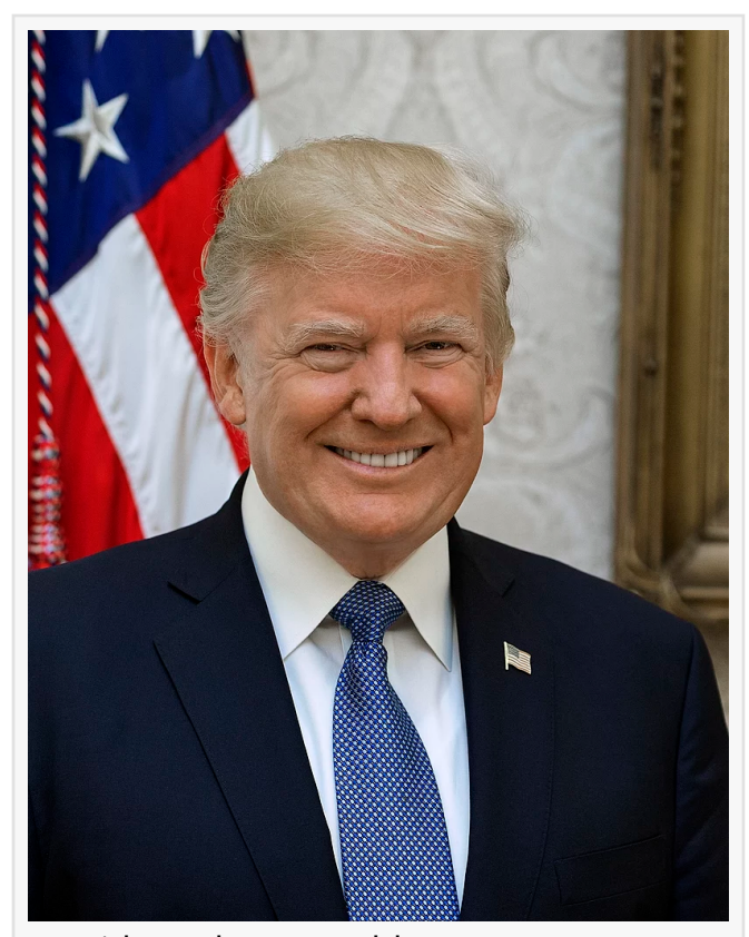
President Elect Donald Trump

Anthony Evans National Black Church Initiative +1 202-744-0184 email us here Visit us on social media: Facebook X Instagram YouTube