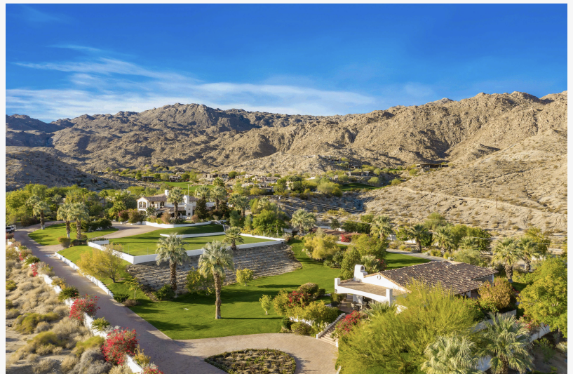
71555 Jaguar Way, Palm Desert, California

Located at 71555 Jaguar Way in the prestigious Cahuilla Hills community, the private estate is set on five acres of secluded, gated grounds and boasts 9,774 square feet of luxurious living space and patios, offering an inviting atmosphere with breathtaking panoramic views of the surrounding mountains and valley. The spanning property—ideal for rental potential with previous guests inclusive of Sydney Sweeney, Lady Gaga, Bill Gates, and more—includes a main house, a cozy bungalow, and two charming poolside