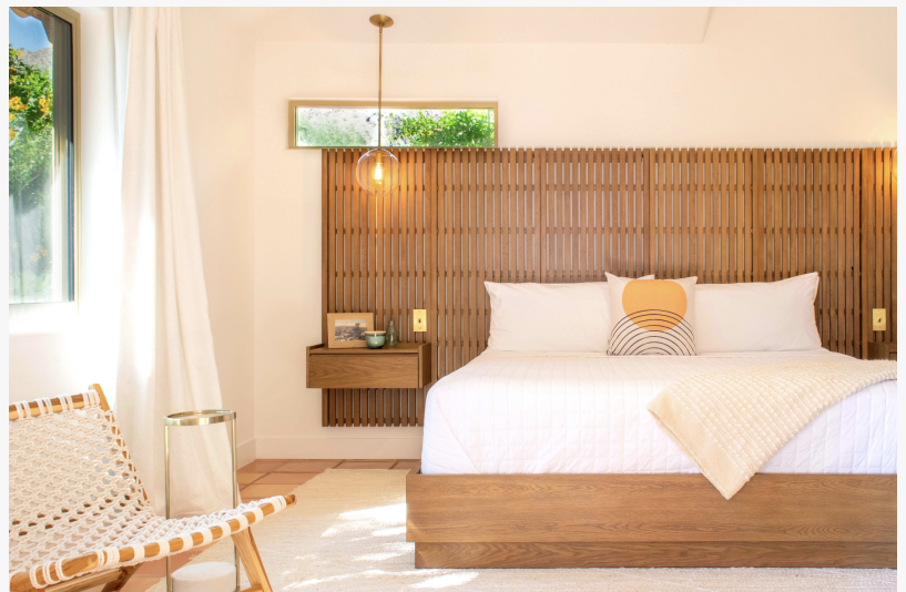
The estate boasts 8 bedrooms and 10 bathrooms across multiple dwellings: a main house, cozy bungalow, and charming poolside villas, perfect for entertaining or hosting guests of any kind.