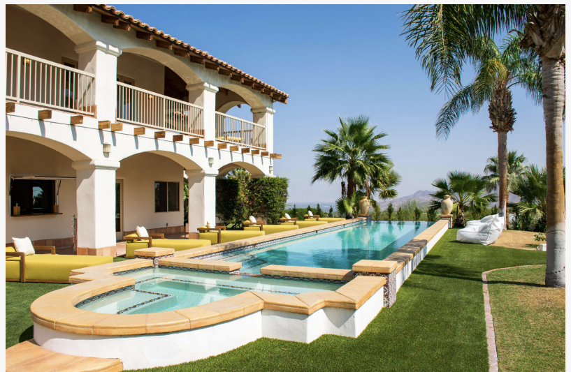
Ideal as a private retreat with rental income potential, the gated estate includes an infinity pool, lush tropical gardens, and a lake