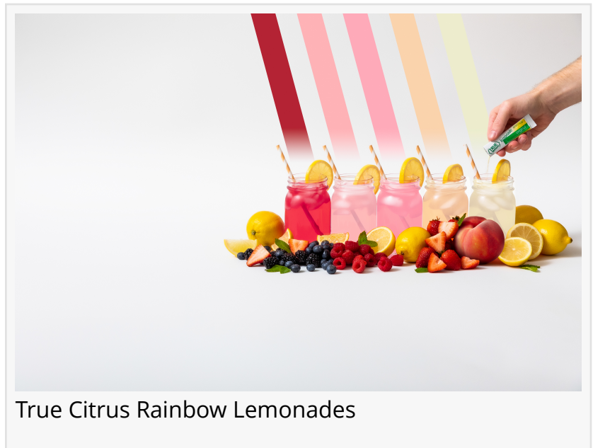
True Citrus Rainbow Lemonades

us to better provide excellent customer service and support. We look forward to serving our existing customers along with new customers within our new fresh online marketplace”, she added.