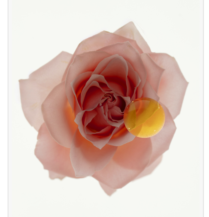
Courtney Dailey Beauty Photography Floral Skincare