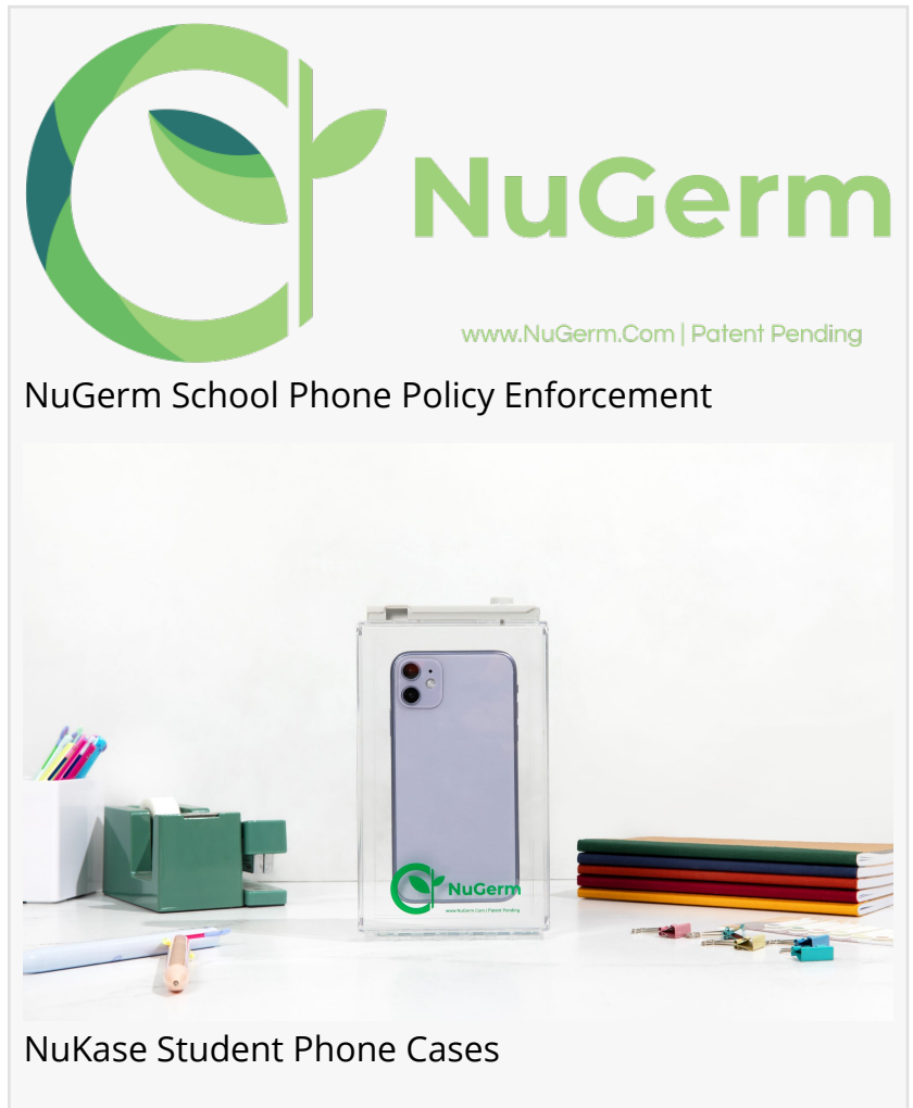
NuKase Student Phone Cases