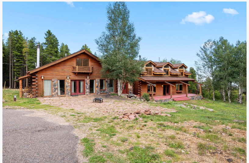
The parcel at 31652 Shadow Mountain Drive features 35.08± acres with an additional multi-unit log-style home.