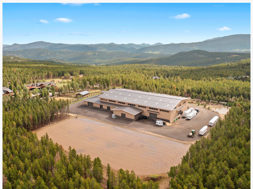
The custom equestrian facilities feature a 20,000-square-foot indoor arena, a 45,000 square-foot outdoor arena, eight stalls, tack room, and more.

Concierge Auctions continues to operate independently, partnering with real estate agents affiliated with many of the industry's leading brokerages to host luxury auctions for clients. For Sotheby's International Realty listings and companies, Concierge Auctions provides Sotheby's brand exclusivity as Sotheby's Concierge Auctions. Since inception in 2008, the firm has generated billions of dollars in sales, broken world records for the highest-priced homes ever sold at auction and sold properties in 46 U.S. states and 35 countries. The firm owns one of the most comprehensive and intelligent databases of high-net-worth real estate buyers and sellers in the industry, and it has committed to build more than 300 homes through its Key For Key® giving program in partnership with Giveback Homes™, which funds new homes for families in