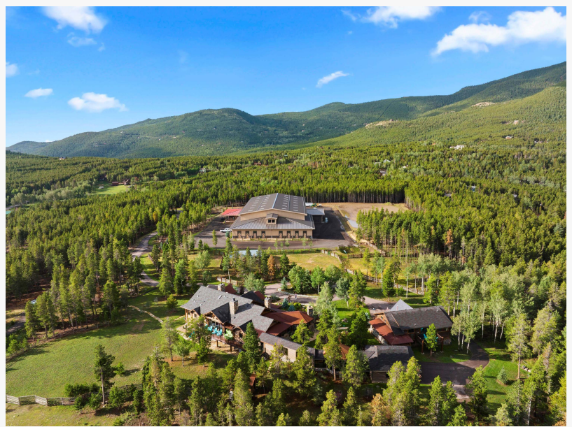
The Second Chance Ranch | 9141 Mountain Ranch Road & 31652 Shadow Mountain Road, Conifer, Denver Area, Colorado