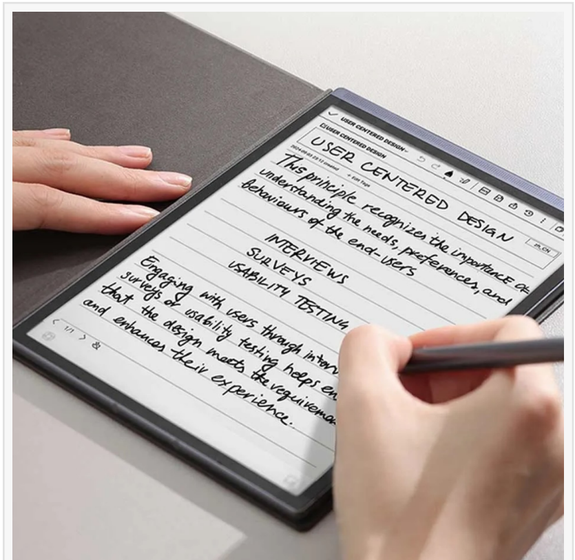
The iFLYTEK AINOTE Air 2, a digital notebook with a paper-like e-ink display.

The AINOTE Air 2 provides a writing experience similar to using pen and paper. The device offers