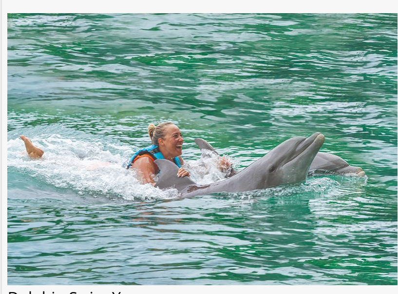
Dolphin Swim Yaaman