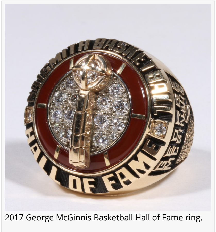
2017 George McGinnis Basketball Hall of Fame ring.

Two ABA championship rings; a Hall of Fame ring; a 1975 ABA MVP trophy; a 1969 State