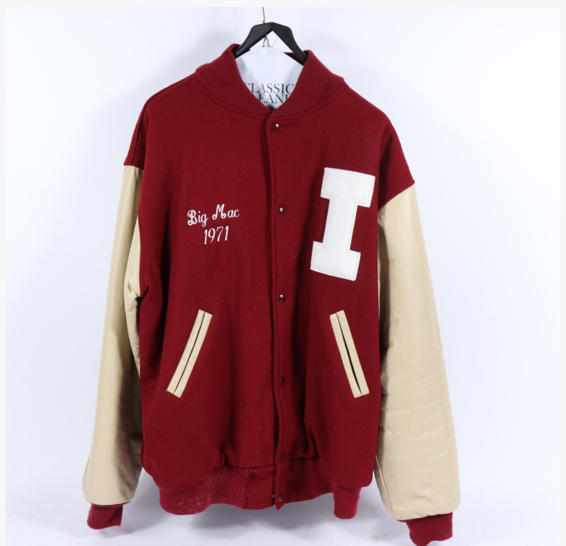
1971 George McGinnis Indiana University letter jacket.