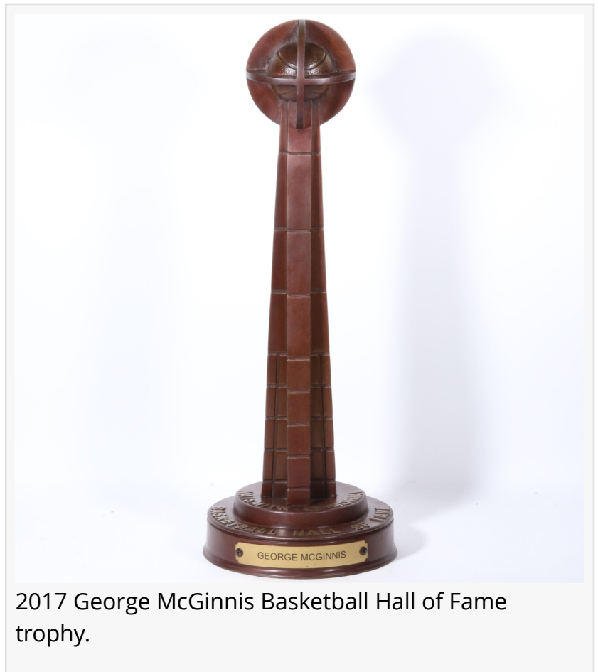
2017 George McGinnis Basketball Hall of Fame trophy.

McGinnis made his NBA debut in 1976 with the Philadelphia 76ers, where he played alongside Julius Erving and Caldwell Jones and was selected to two All-Star games in his three seasons with