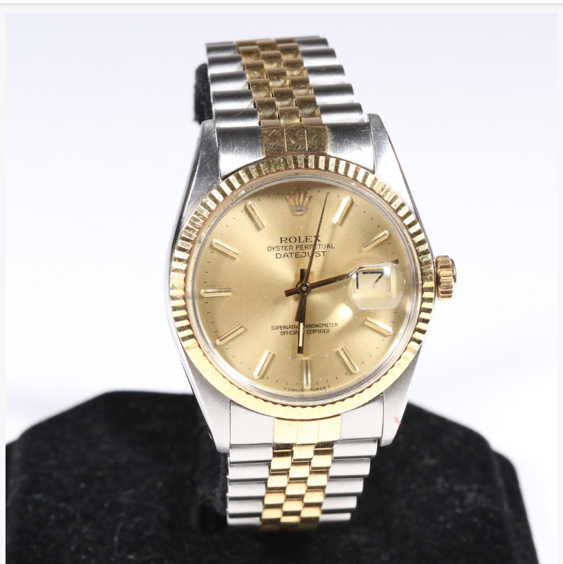
George McGinnis Rolex 18K yellow gold and stainless steel watch.