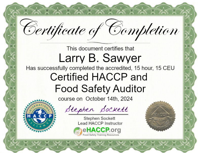
HACCP Auditor certificate