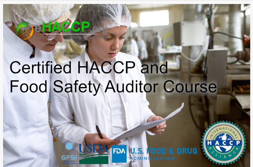
HACCP Auditor course

In addition to these sector-specific courses, eHACCP.org has also launched a new Certified HACCP and Food Safety Auditor Course. This course certifies HACCP practitioners to conduct first and second-party audits, following ISO 19001:2018 guidelines. This is a game-changer for organizations looking to improve their food safety management systems, as it allows them to conduct internal audits and utilize consulting