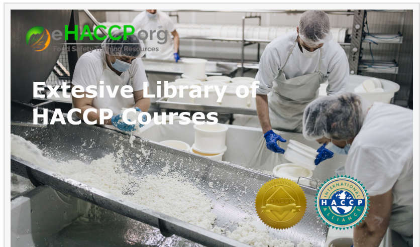
Many HACCP courses to chose from

LUNENBURG, NS, CANADA, November 15, 2024 /EINPresswire.com/ -- eHACCP.org, a leading provider of online HACCP training and certification, today announced the launch of its expanded course catalog. The new catalog includes a wide range of industry-specific HACCP courses, all Certified HACCP courses are accredited by the International HACCP Alliance. They aim to make HACCP training accessible and affordable for everyone in the food industry.