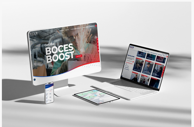
In a world where technology reigns, BOCES' new website shines—no matter what device is used to access it.