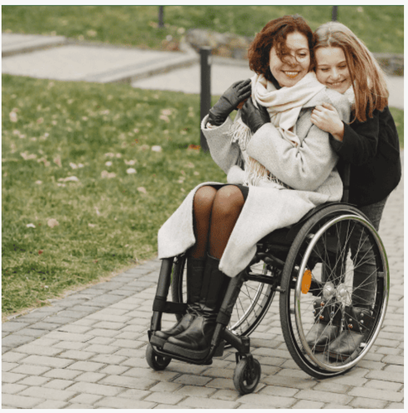
Positive Behaviour Support Brisbane

Advance Care Solutions Advance Care Solutions +61 1300 857 454 info@advancecaresolutions.com.au Visit us on social media: LinkedIn