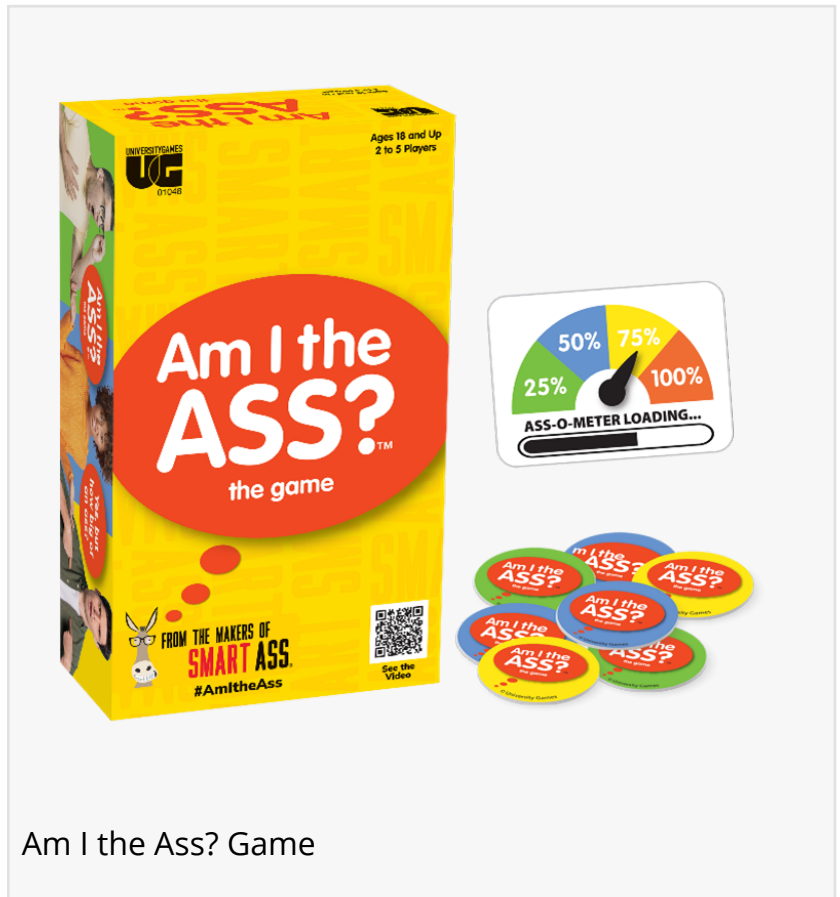
Am I the Ass? Game

Am I the Ass? joins other popular titles from University Games, including Smart Ass, Drunk Ass,