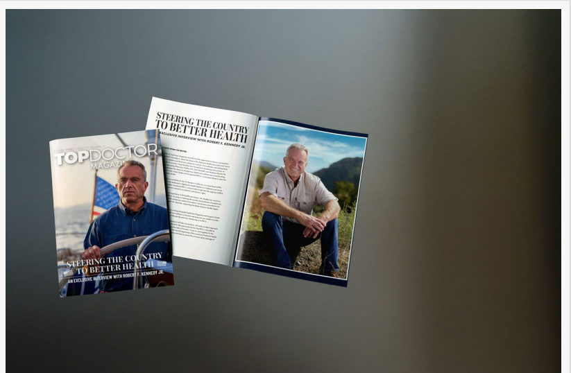
Top Doctor Magazine Cover RFK Jr.

innovative practices, and profiles of thought leaders, Top Doctor Magazine inspires progress and excellence in the healthcare industry. For more information, visit Top Doctor Magazine.