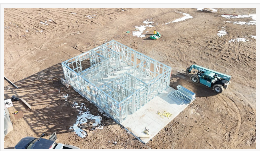
Drone View of Quinn Barndominium being erected

FRISCO, TX, UNITED STATES, November 18, 2024 /EINPresswire.com/ -- My Barndo Plans, a division of Home Plans LLC, is proud to announce the ongoing construction of three barndominiums in November, including a standout project in Mosca, Colorado. Based on the popular Quinn floor plan, this build