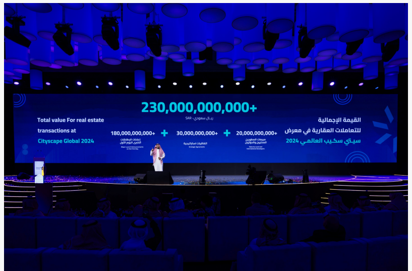
Cityscape Global Closes with Record-Breaking US$61 Billion in Real Estate Transactions