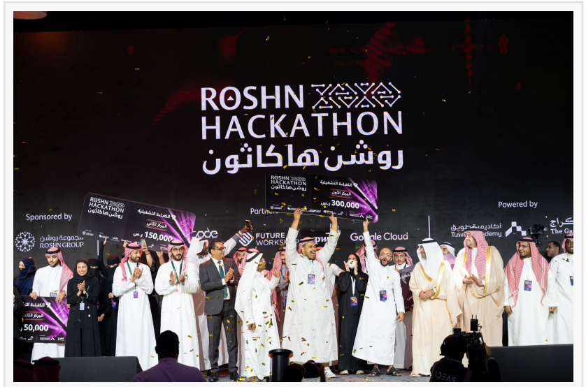
Second ROSHN Hackathon Awards SAR1.5 Million to Nine Winners

The mega-show's final day painted a vision of the future of real estate: From space travel, self-governing floating communities and naturally sunlit underground parks, to autonomous drone canopies that can regreen deserts and entire health-focused cities built atop the ocean. Yet projects that relate so closely to the natural