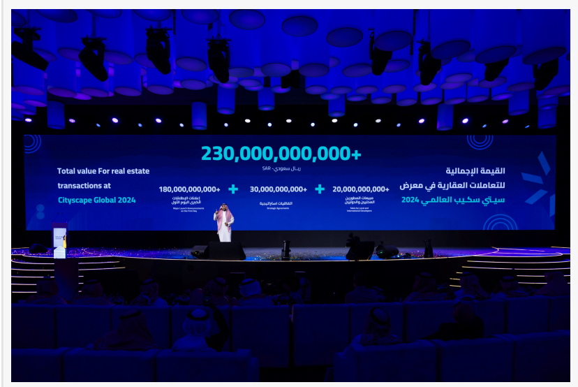
Cityscape Global Closes with Record-Breaking US$61 Billion in Real Estate Transactions

Cityscape Global' substantial potential for the industry, Sturgess explained how the developer of a 25-building development, sold 5 of those buildings, in just the first hour of the show. Another developer sold 70 per cent of their off-plan project in the first two days, noted Sturgess, while another sold every unit in their development in three days. Additionally, a 600,000 sqm parcel of land in North Riyadh set a new Guinness World Record for an auction lot. The landmark sale achieved a price of SAR3.68 bn (US$979 million).