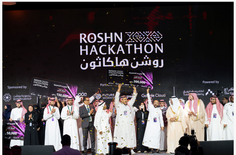
Second ROSHN Hackathon Awards SAR1.5 Million to Nine Winners