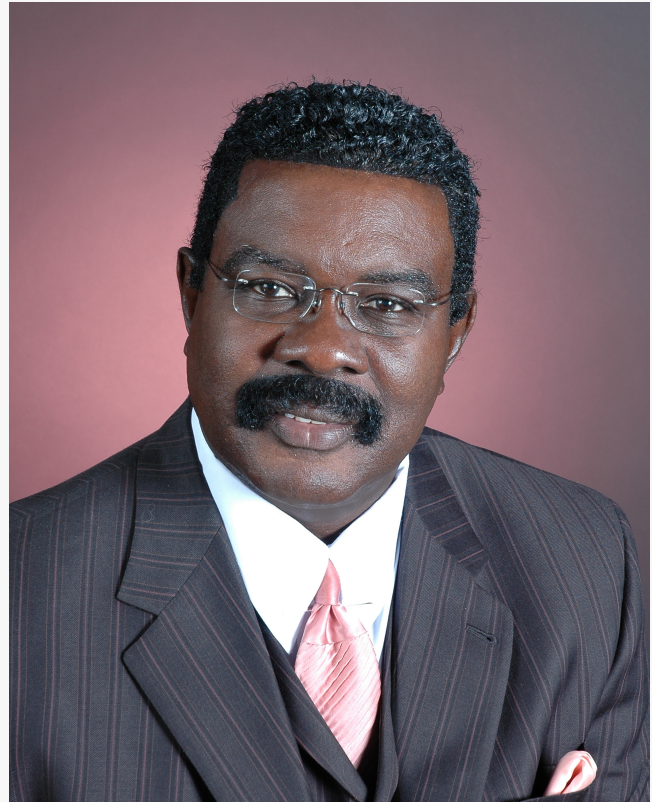
NVBDC Board of Directors

FIND US | LIKE US | FOLLOW US | JOIN US: LinkedIn, Facebook, Twitter, Instagram, and RallyPoint