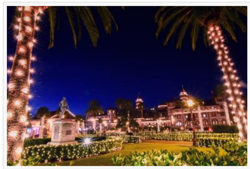
Lightner Museum in Historic St Augustine shines during Nights of Lights - FloridasHistoricCoast.com