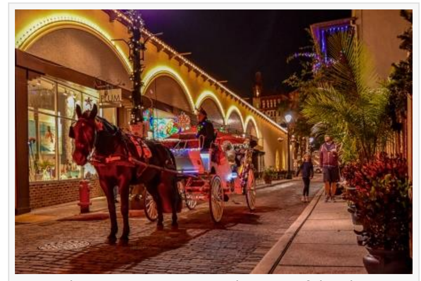
Horse drawn carriage stopped at one of the shops on St. Augustine's Aviles Street at Christmas

Florida's Historic Coast is all about waterfront fun year-round. Select from handcrafted items, home décor, and more while enjoying beach breezes at