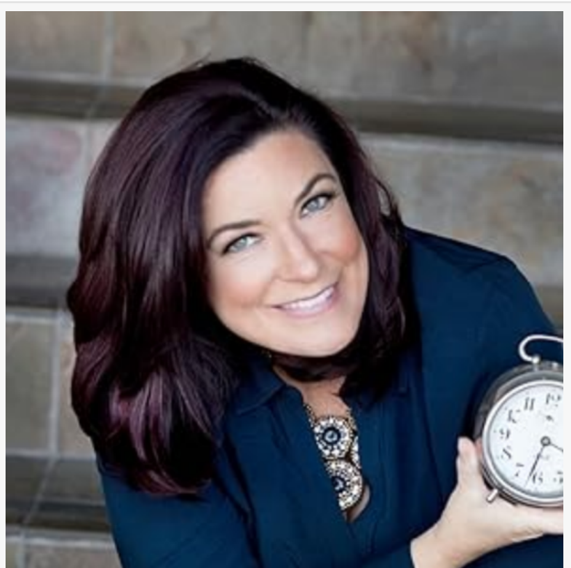
Stacey Yates Sellar

EINPresswire.com/ -- Best-selling author, double-certified coach, and internationally acclaimed speaker Stacey Yates Sellar is set to revolutionize the world of reality television with her newest venture—a transformative reality show designed to uplift and educate struggling moms. Currently in development, the show aims to bring the principles of Positive Psychology and Conscious Parenting to millions of viewers, offering practical tools and inspiration for navigating the complexities of modern motherhood.