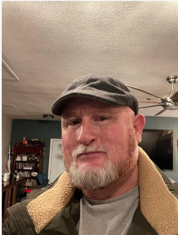
Author of the book Jordan's Voice