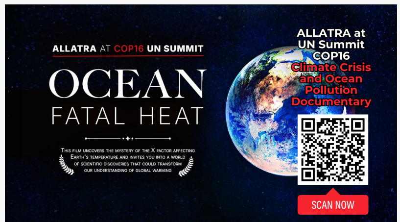
ALLATRA at UN Summit COP16 | Climate Crisis and Ocean Pollution Documentary