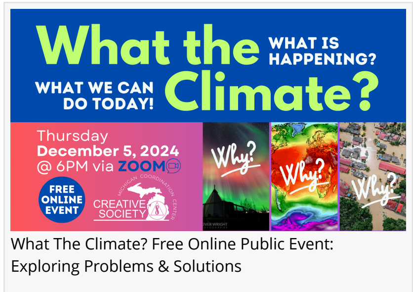
What The Climate? Free Online Public Event: Exploring Problems & Solutions

EINPresswire.com/ -- Volunteers from the Creative Society Michigan Coordination Center have launched a new online event series aimed at making critical climate information accessible to everyone. Titled " What The Climate? Exploring Problems & Solutions ," the series seeks to equip attendees with knowledge about the challenges and solutions surrounding the climate crisis.